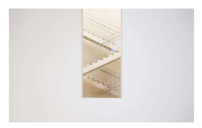
Figure 3: Photo by Todd Quackenbush on Unsplash