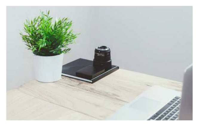
Figure 6: