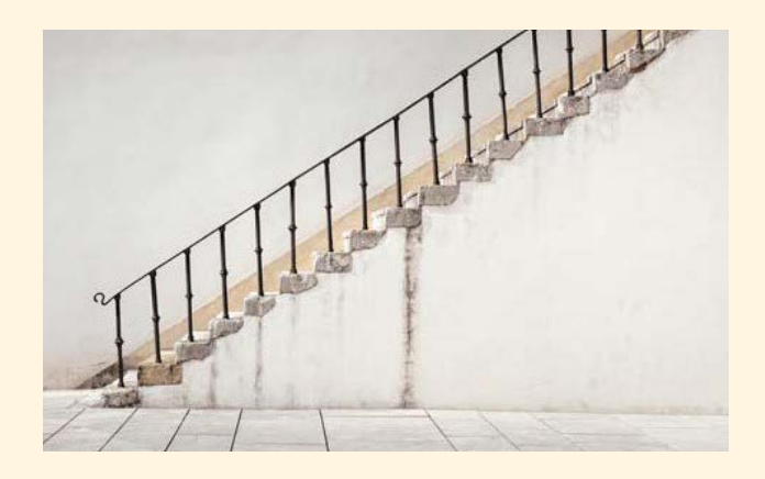
Figure 7: Photo by Samuel Zeller on Unsplash

How many times have you sat in a presentation and the speaker says "sorry, I know you may not be able to see this but...". You can prevent that from happening by making sure your images are large – use the whole slide instead of constraining them to a box. If you are using text on your images, make sure it is big enough to be read from the back of the room.