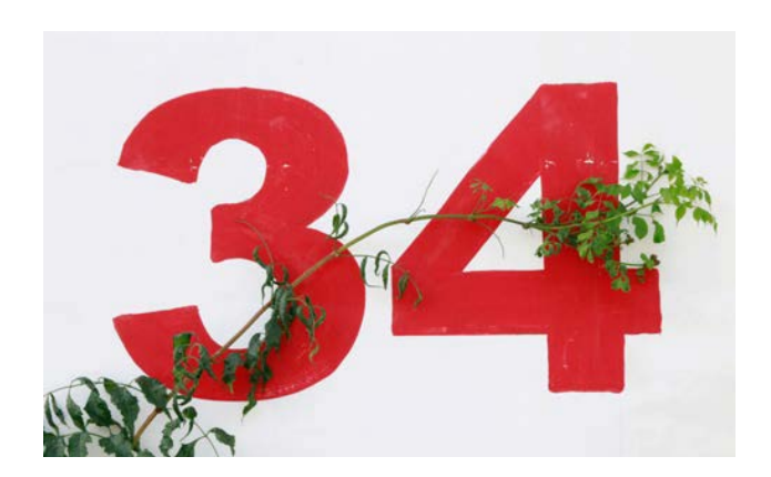
Figure 8: