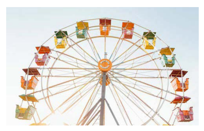
Figure 9: Photo by Hannah Morgan on Unsplash